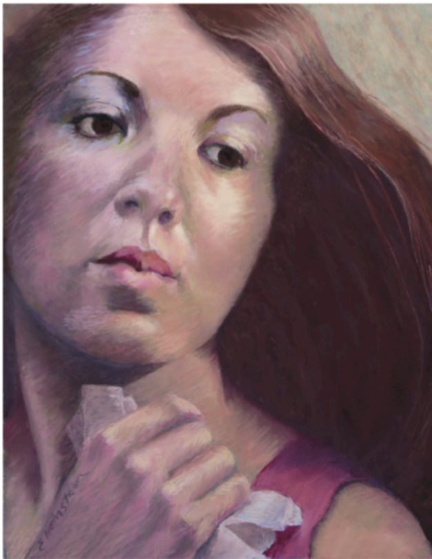
The Letter, by Earlene Holmstrom Best In Show, 2018 Fall Show